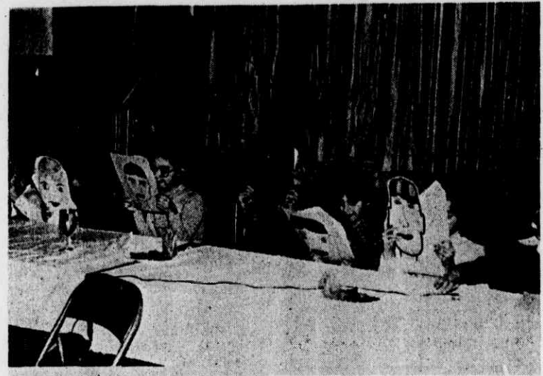
Children cavorting at Hebrew Academy's Tu B'Shvat