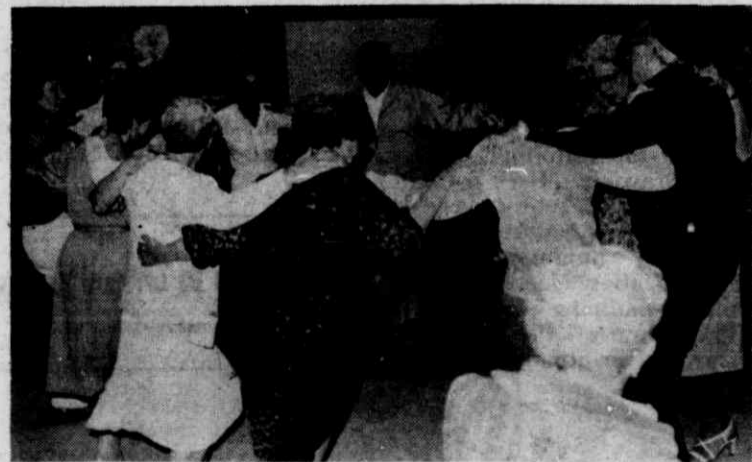
Dance time is fun time.