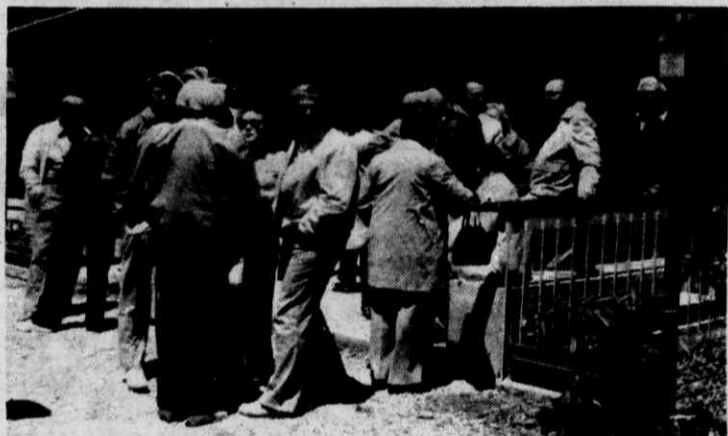
The "chow/hounds" —waiting for dining hall to open.