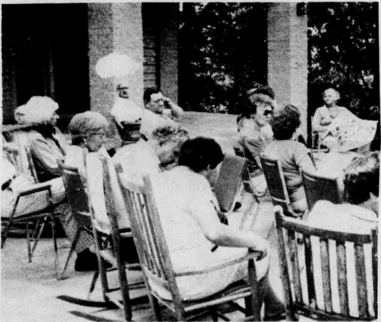
Group joins in Hadassah reading "The Mishpochah".