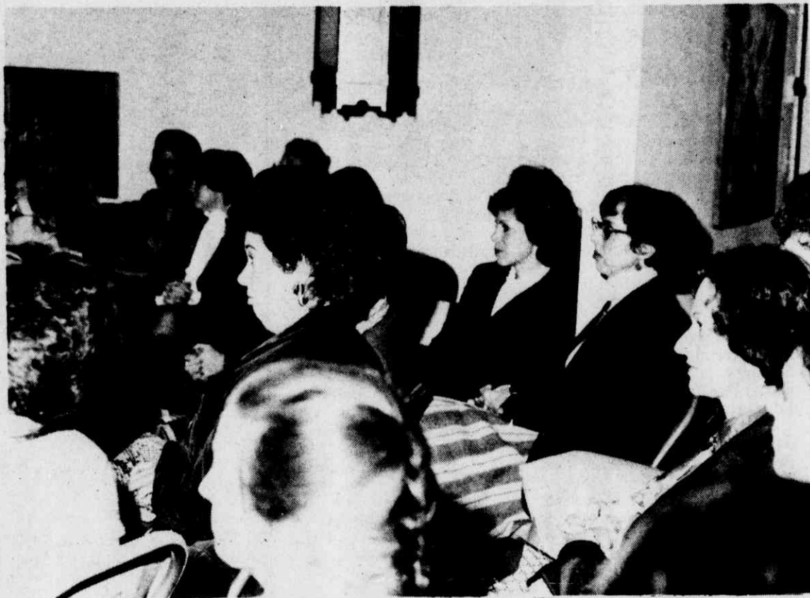
Women at Brunch enthralled with Lt. Col. Hermon's speech.