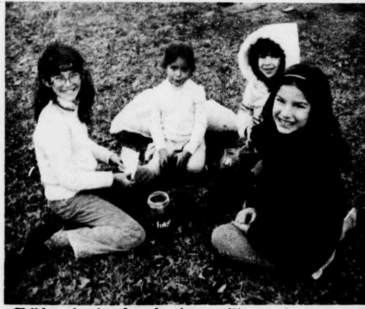
Children having fun planting seedlings in keeping with