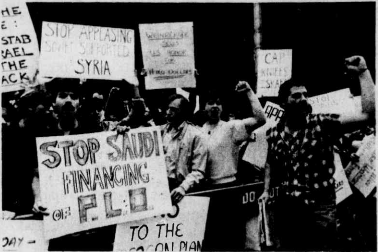
Members and sympathizers of Americans for a Safe Israel, the National Council of Young Israel and the Jewish Mobilization Committee held a demonstration outside the New York Hilton to protest the policies of Defense Secretary Caspar Weinberger. The Secretary was inside the Hotel at the time addressing a luncheon given by the American Jewish Committee.