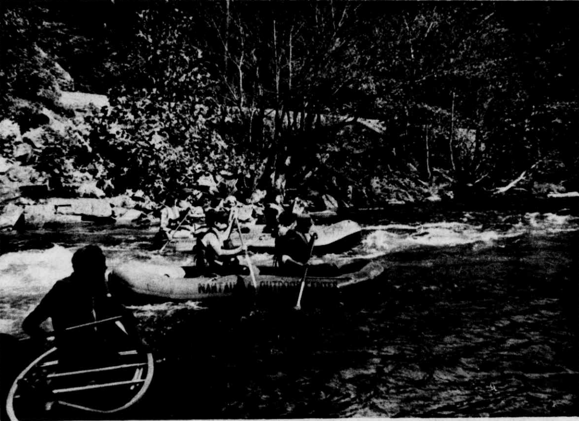
The JCC ran a swift moving raft trip down the Nantahala River June 12. Fifteen people maneuvered rafts on the warm sunny day trip which kept them waterborn for nearly three hours. Warming up at lunch in the outdoor center restaurant, they then made their way back to Charlotte by nightfall. Another trip has been organized for August 7 to the French Broad River near Asheville.