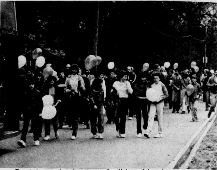
Participants joining "together" in celebration

heavy equipment which will begin the transformation of the project into reality.