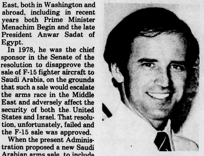
Senator Joseph Biden

United States, as well as against the security of both Israel and Saudi Arabia itself.