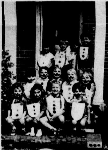
Four-year-olds on Circus Day.