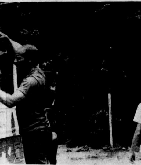
Working with campers to decorate bus.