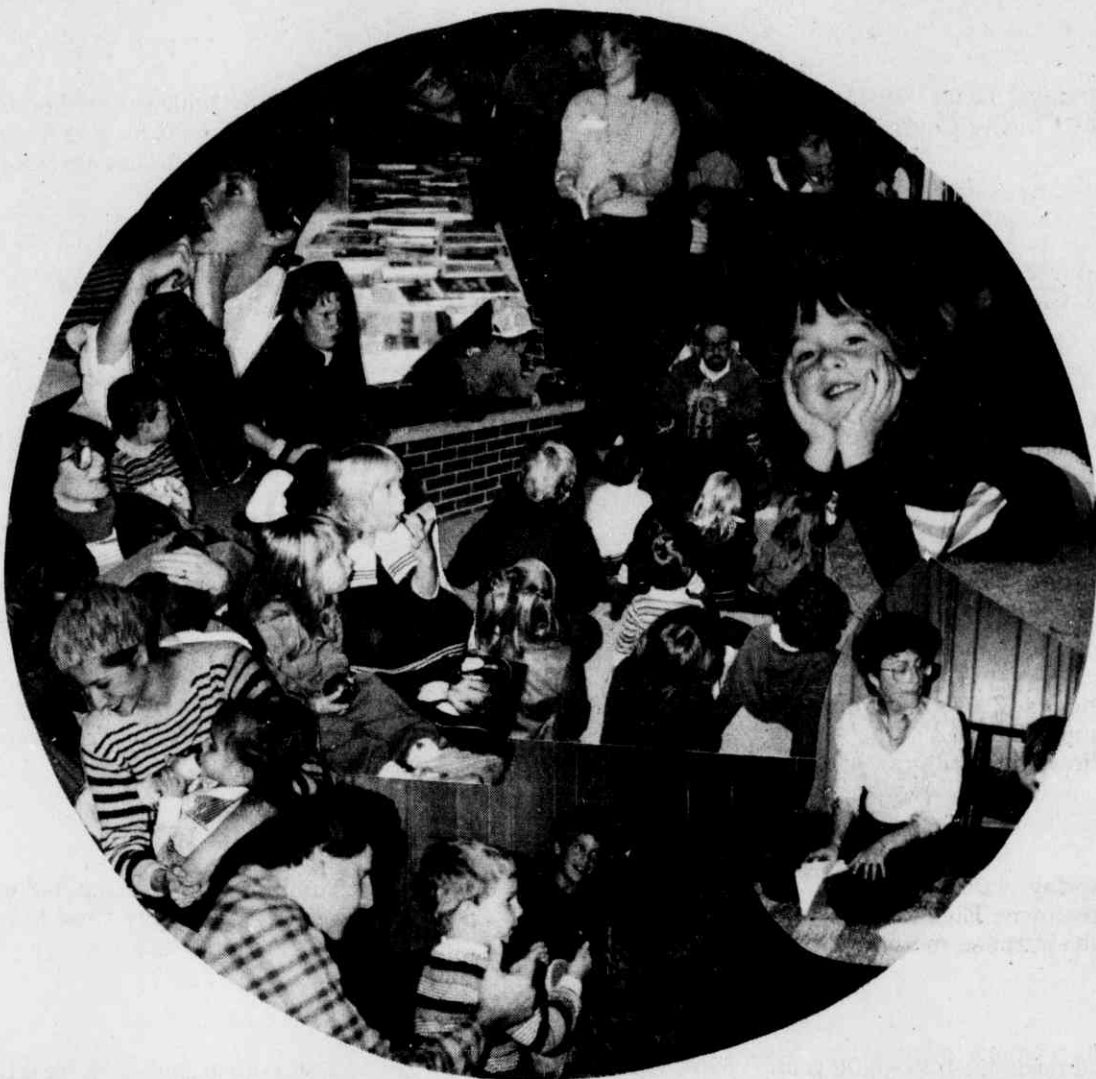
JCC - The Center of Things: The Book Fair and Storytelling Festival Open House at Armstrong House, sponsored by the "J". It honored Jewish Book Month.

Discount tickets ($2.75) available at "J" office for theaters at EASTLAND SOUTHPARK, and CHARLOTTETOWN.