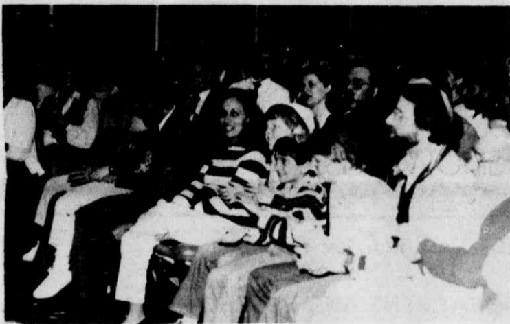
Not an empty seat in the house!

There was plenty of good food: traditional Chanukah latkes, home baked cakes and other delicacies as well. "This was the most enjoyable evening of the year" one participant was heard saying at the end of the evening.