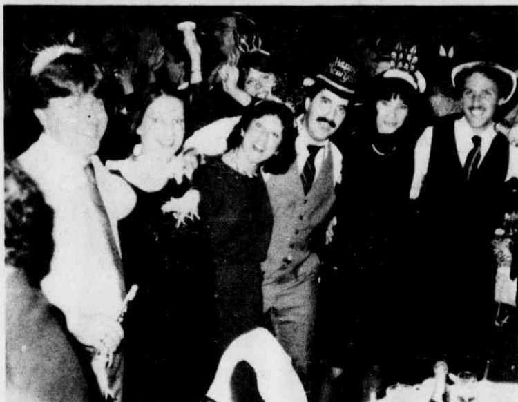
From all of us to all of you - "A Happy New Year."

As the JCC is no longer open on weekends except for special events, a taped recording of weekly JCC activities and highlights will be available by dialing the JCC phone number (366-0357). Please let us know if you have suggestions for our recordings.