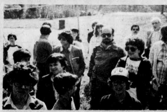
Part of large crowd taking part in Afikomen Hunt.

Your Family could win $125 toward a JCC membership or a b/w portable TV! HERE'S HOW