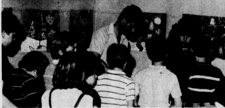
Lined up for the hot dogs, knishes and Hamantaschen.

On Sunday, February 24, a fantastic Purim Blast was felt in Charlotte. It was the annual Purim party sponsored by Lubavitch of North Carolina.