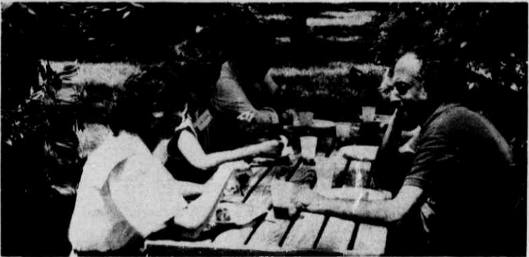
Time out to enjoy lunch at the Board Training Institute held May 19.