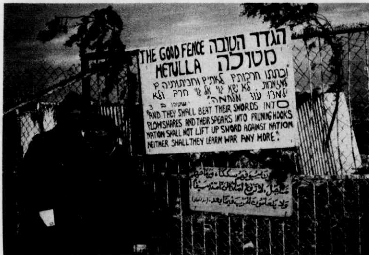
Bobbie (L) and Wilma Saly at The Good Fence Metulla.

roduced to our representative, mine and yours, Hadassah. We were shown around Scopus and Ein Kerem. Here are a few facts: You have an x-ray there, 90 seconds later the doctor is examining it. You have an operation; you're lying on the table top on which you will be operated; the patient ahead is wheeled away and your table is wheeled under the lights -