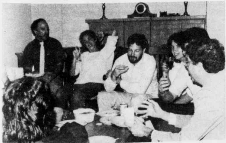
Enjoying the "Break-Fast."

For those of you unfamiliar with the group, Pizazz is an organization comprised of young, single, Jewish people whose main goal is to provide social events for Charlotte area Jewish singles in their early 20s to mid-30s. Pizazz offers monthly programming, ranging from summertime baseball games to uptown nightlife tours, parties, lectures and all 'round good times. It's a great way to mix, meet and mingle.