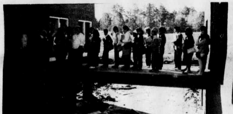
Crossing the bridge connecting the two buildings.