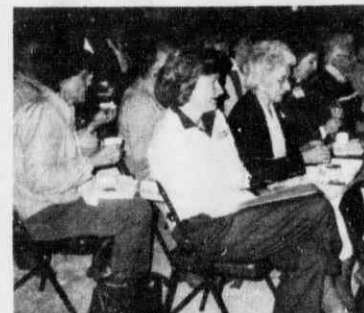
Having brunch in the new facility.