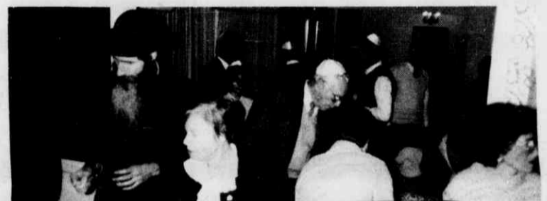
What's a party without food?