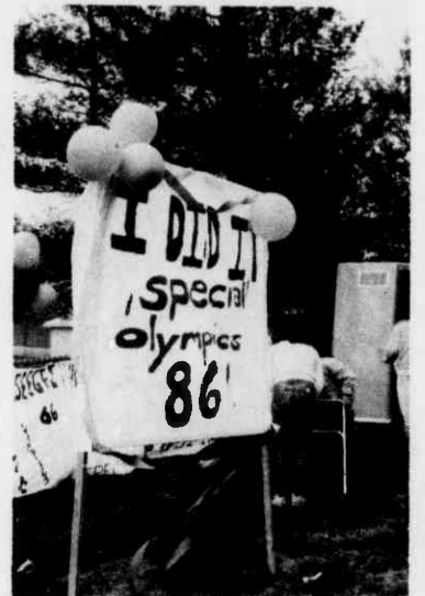
Getting ready for the Special Olympics.