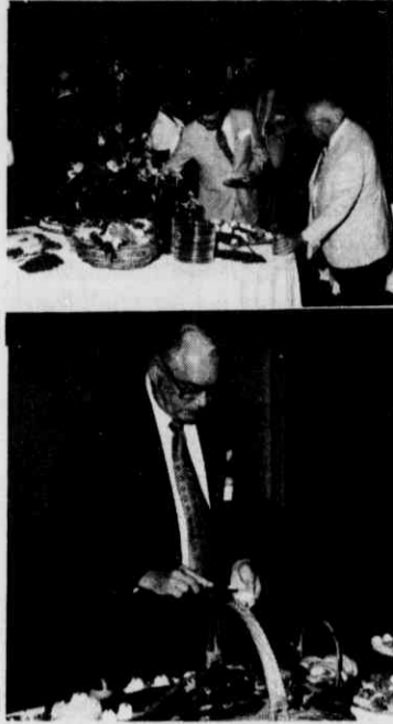
Special preview reception held May 15.