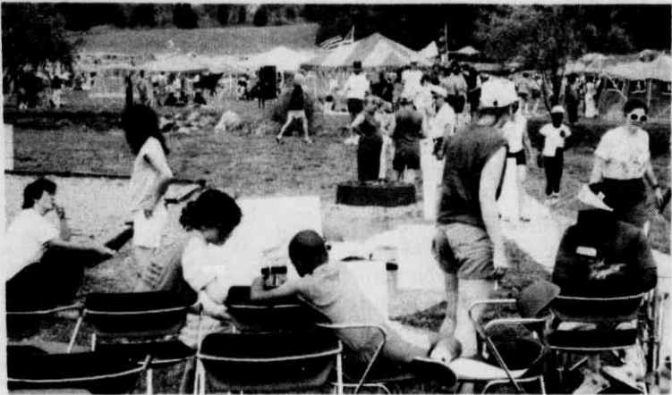
Helping out at the Special Olympics

UNCC was very busy the last weekend of May with children from all over North Carolina participating in Special Olympics. Members of Ha Lailah Chapter of B'nai B'rith Women were there meeting the children and having very special Safety Awareness classes. The children who came by were given pictures to color of telephones, houses, and a blank sheet on which to draw their families. The children were then asked if they knew their phone numbers, addresses, family members' names, and whom to call if they need help. This information was then put on the sheets that they had colored. The children also practiced dialing the operator and 911 in case of emergencies, talked about going in pairs, yelling "help", and how the police help when you are in trouble. The parents and teachers who came by were greatly appreciative of the information and the time that was given to the children. Some took the information back to their cities to fill out with children who were not there. The Ha Lailah members left feeling good about the time they had spent with these very special children.