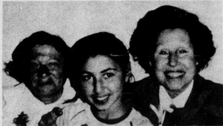
One of the children and one of the ladies who watch over the writer (on right) each year when she visits Nazaret Illit.

Words can not express the joy and elation I felt as I toured Shalom Park. This was my first visit and all I could do was to silently praise G-d!