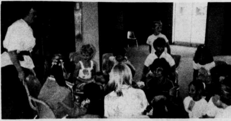
Many of the students gather together in the multipurpose room to do fun activities during snack time.