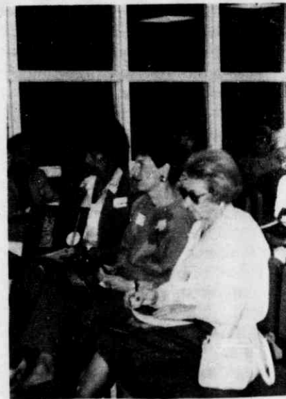
The Alive Class cosponsored by JCC and