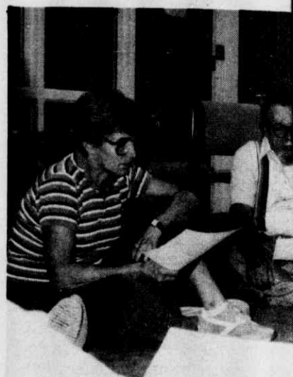
Reading a play in Conni