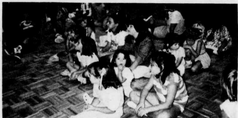
Creative T'fillah Service