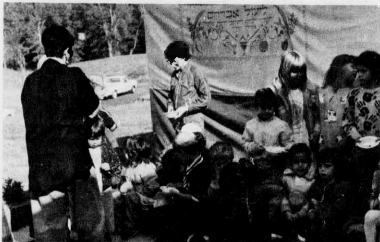
Academy and Lubavitch pre-school children outside the Sukkah.

The children from Gan Yeladim (Lubavitch nursery school) were invited to join in