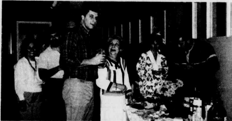
At the opening reception.