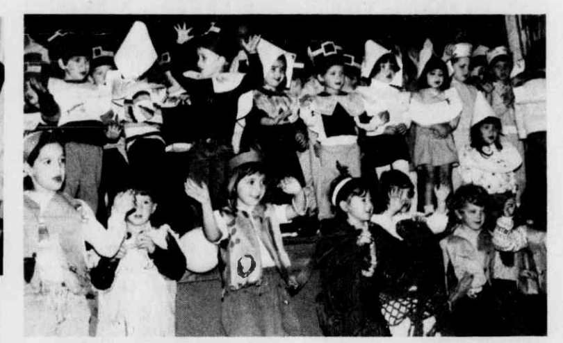
Hebrew Academy & Temple Israel Pre-schoolers cavorting and singing "Our Family."