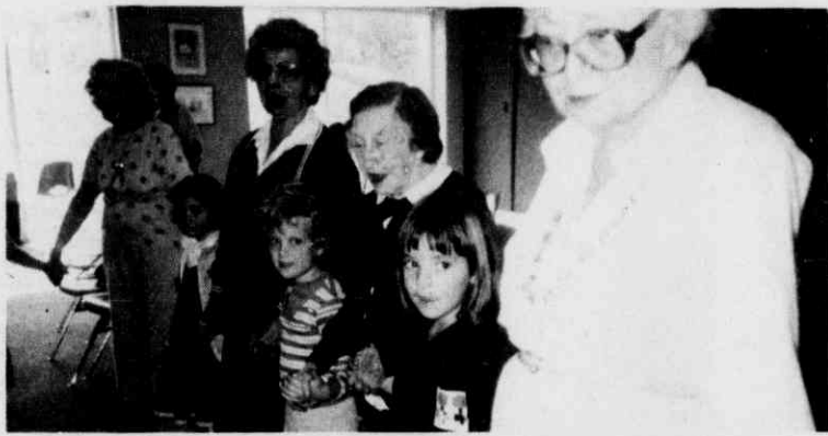
Chai members sharing Academy's Shabbat period with kindergarten children.