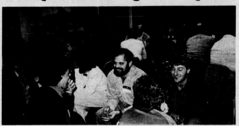
Participants at orientation meeting.

Over the next year and a half, the group will meet monthly to learn about and discuss local, national and world-wide Jewish issues. They will serve as participant observers on