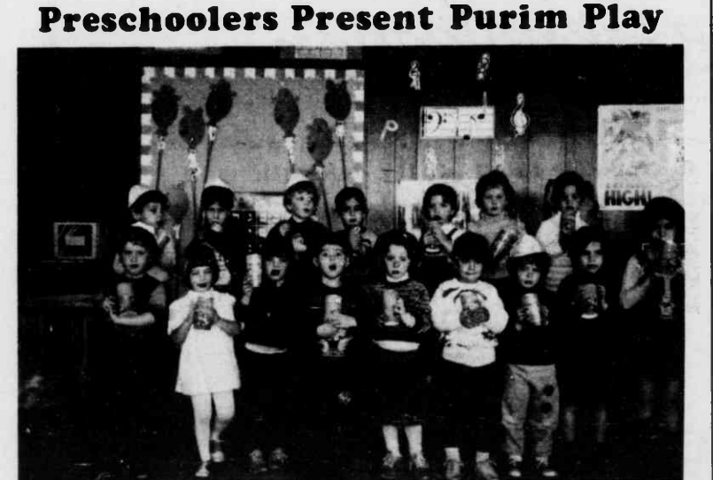
Preschoolers with their Tzedakah boxes.

Scholarships are available. No child is turned away because of inability to pay. Confidential fee adjustments can be made by arranging an appointment with the director.