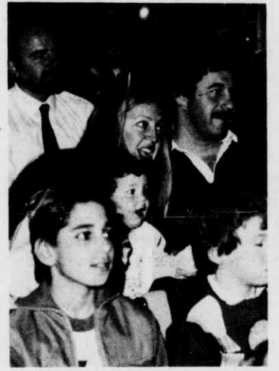
Parents and children enjoyed the afternoon.

The program included a puppet show and clowns. New York City delicasies were also