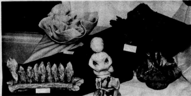
Beautiful ceramic pieces.