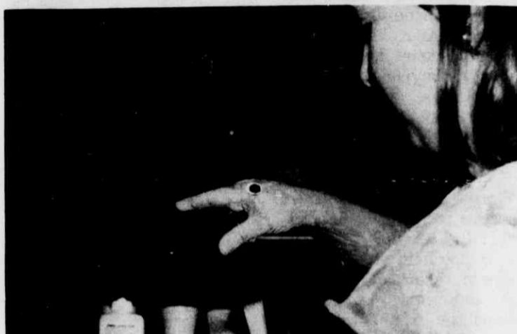
The completed "Hanimal". Quack! Quack!