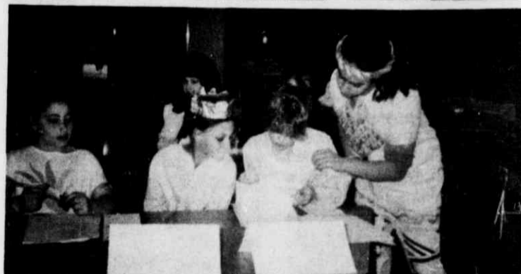
These pictures depict the "Prosecution and the Defense Attorneys" preparing for the "Trial of King Saul".