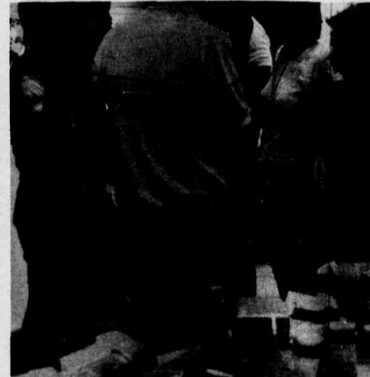
Plenty of good fellowship and delicious ice cream.