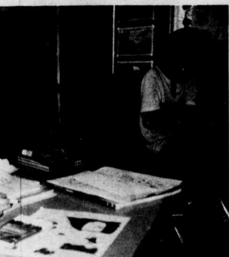
ni prepare for their first day at school.