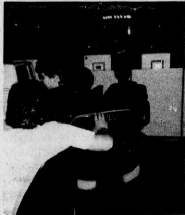
Charlotte Jewish Day School students enjoying the computer class.