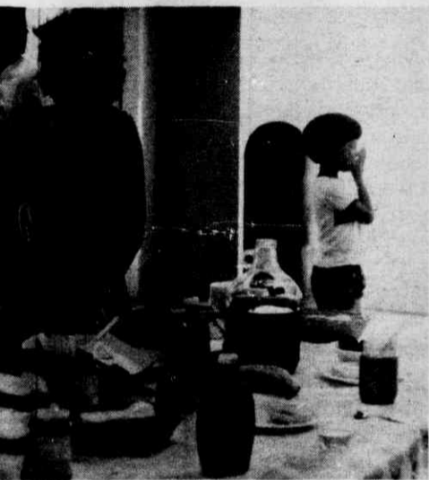
ous ice cream made the day enjoyable.