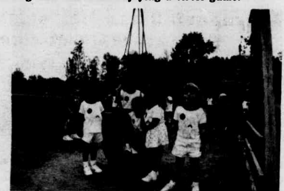
Temple Israel Preschool's four-year-old groups on the playground.