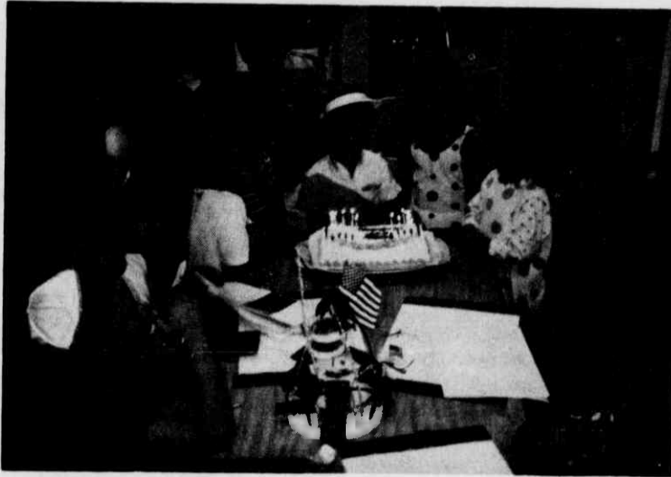
When can we blow out the candles on the cake?

The children at the Charlotte Jewish Day School will be saving cans to help save burned children. In conjunction with the firefighters of Charlotte, our students will be collecting aluminum soft drink cans for recycling by Alcoa. Whatever money is raised by this effort will be donated to benefit the burned children in the North Carolina Jaycee Burn Unit at Chapel Hill. It is a nice mitzvah to be able to help other boys and girls who are less fortunate at times like this, and need our viable support. Plus it teaches the students to conserve critical landfill space, conserve our natural resources and at the same time make the effort to help make Charlotte a more attractive city with a clean environment. Everybody wins; nobody loses!