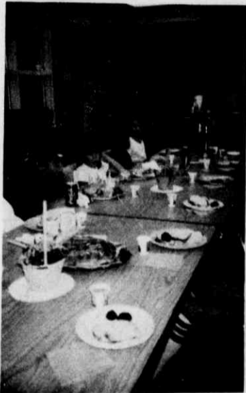
Students celebrating their Shabbat in the Chai Lounge.

Ahad HaAm, letter to J.L. Magnes, Sept. 18, 1910