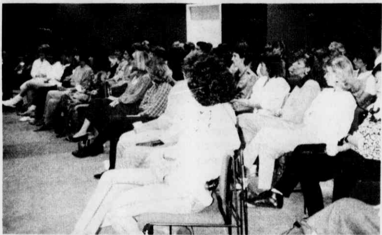
Parents listening and absorbing as much information as possible.