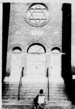
Open to me the gates of justice... COMMISSION ON JEWS WITH DISABILITIES