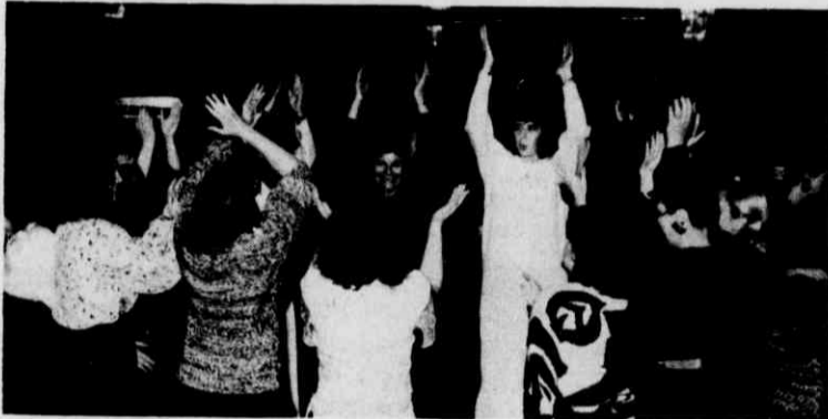
The women did their share of dancing too.

Senator Rauch's visit to the Lubavitcher Rebbe.