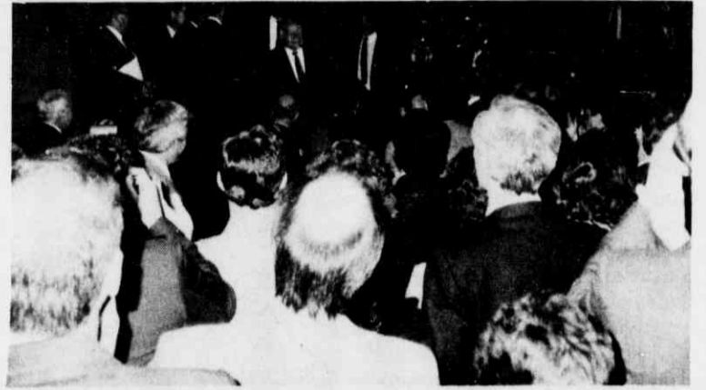
Three thousand delegates welcomed Israeli Prime Minister Shamir (center).