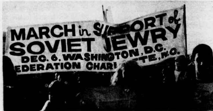
Charlotte Jewish youth carrying banners in Soviet Jewry March, Dec. '87.

The UJA Department of Communications/Public Relations, Speakers Bureau, National Training Center and