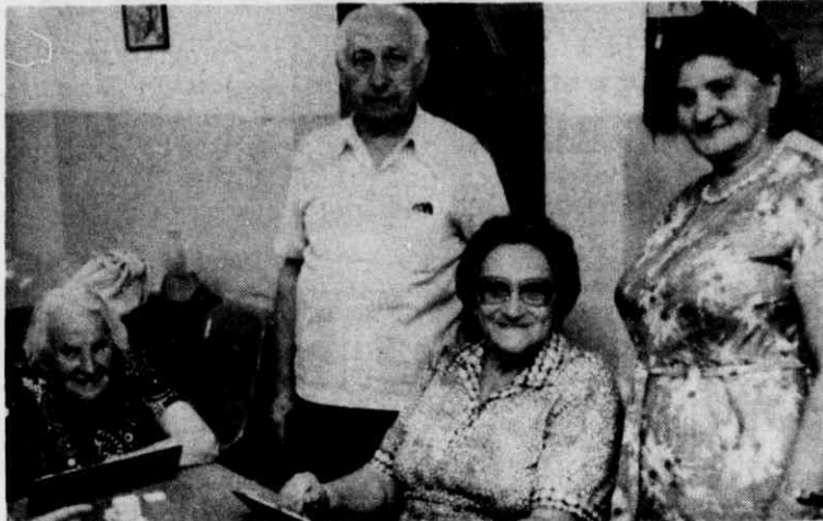
JDC in action: Helps meet the needs of elderly Jews and makes it easier for them and others to enjoy their lives.

Since 1979, hundreds of thousands of American Jews have supplemented their regular Campaign commitments with contributions to the communities' twinned Project Renewal neighborhoods. Charlotte's "twin" is Nazaret Illit. Project Renewal's goal is to raise the low standard-of-living, job-skill and educational levels in Israel's immigrant neighborhoods. The program links Renewal areas with Diaspora communities which fund physical, economic and social rehabilitation projects. Priorities are determined by neighborhood residents, in consultation with their linked Diaspora com-