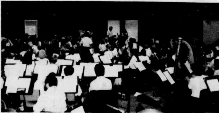
Members of the "Summer Pops" tuning up as the audience begins to arrive.

July 30 was a great night for a pool party. We watched comedy movies by moonlight, took a very refreshing swim, and enjoyed drinks and munchies by the pool.