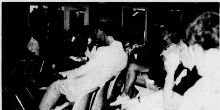
Group at a Mission meeting.