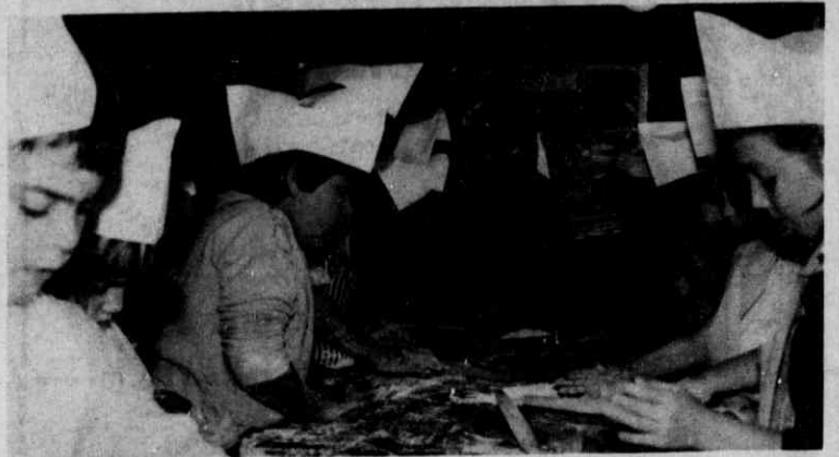
Young participants at the Lubavitch model Matzoh Bakery.