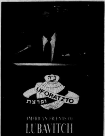
Senator Terry Sanford addressing "Education Day USA."

Senator Sanford expressed his good wishes to the Rebbe and was especially proud that Lubavitch has two centers in North Carolina, one in Charlotte, the other in Raleigh. The Senator said that Lubavitch is the only group which comes to Washington as a non-self-interest group. "Your interest is good and decent education; it is people like