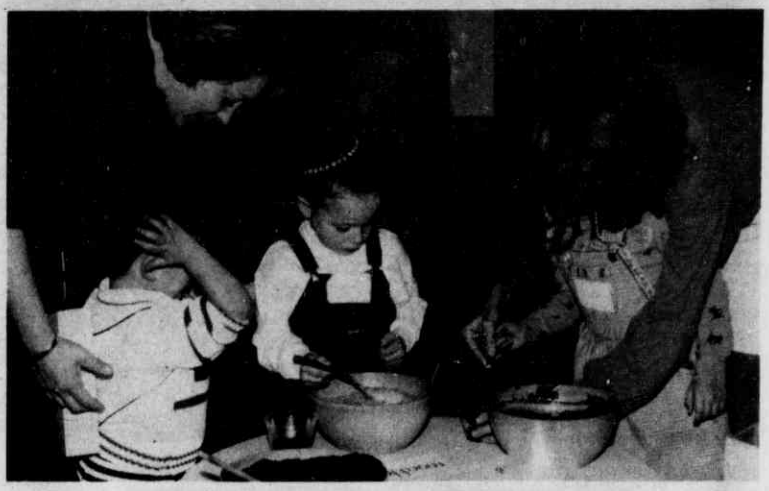
Children preparing "edible food" at Earthly Event.