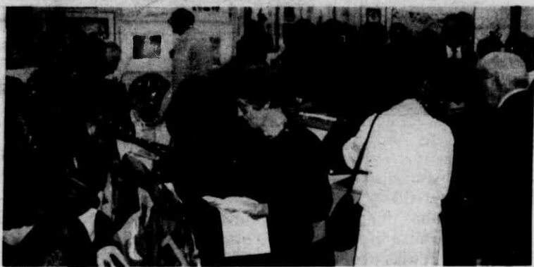
The Collector's Corner was one of the main attractions at the show.