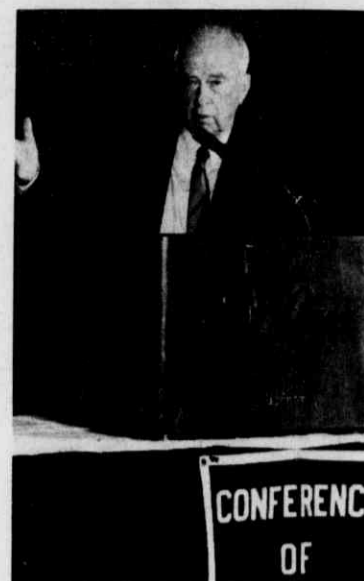
Prime Minister Yitzhak Rabin also addressed the Conference of Presidents of Major American Jewish Organizations.