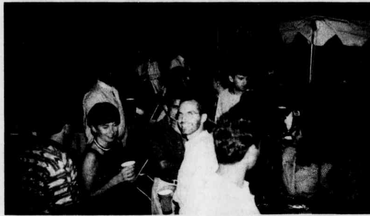
Everyone had a GREAT time at the "Break The Fast"