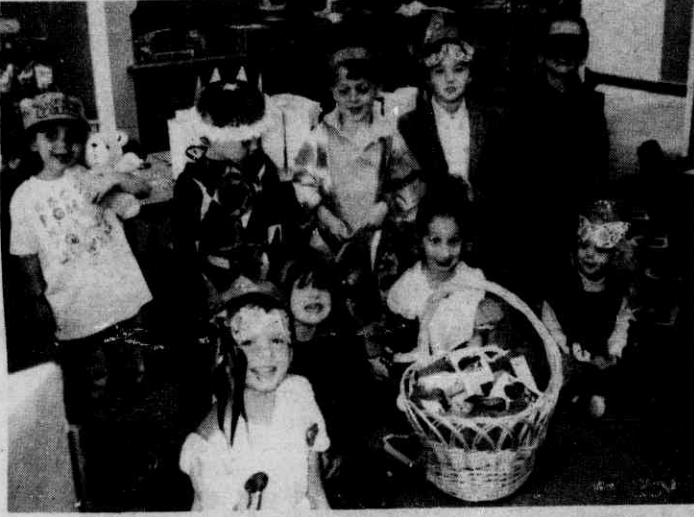
From Torah Pizza to Schalock Manet at Purim, Judaism is celebrated year-round.