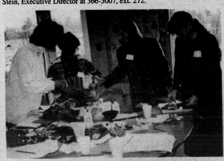
CAJE is the place to create one-of-a-kind learning materials for Jewish homes and classrooms. Here, preschool and Sunday school teachers work together to design games about Israel for their classrooms.