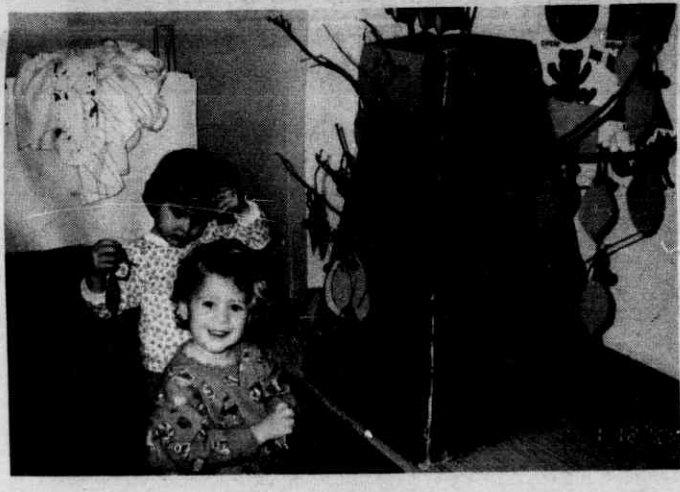
The Charlotte Jewish Preschool is dedicated to teaching young children the fundamentals of Judaism through a process of joyous discovery.