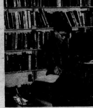
These third graders are looki project (Temple Israel Gime

The Speizman Jewish Libra wing of the JCC building is no serves all the synagogues at SI Jewish Library is open for the No card is required. Please sto non-fiction collection, or chec hours and more information p